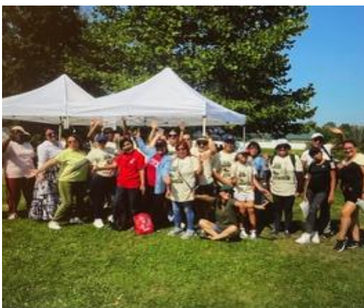
(54 mothers and children attending the Great Swamp's Fall Festival in September)